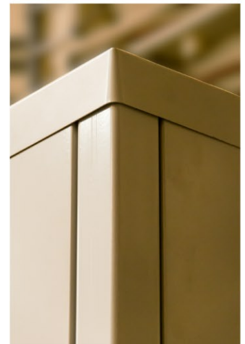
Pre made head & base corner channels